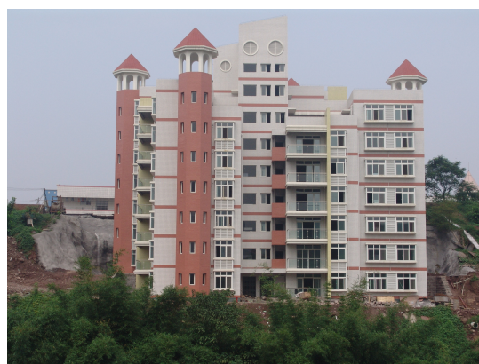
The new special needs home—Chongqing

homes – just like those we would all like to live in. The fit outs will be done with care and attention to creating a warm comforting environment.