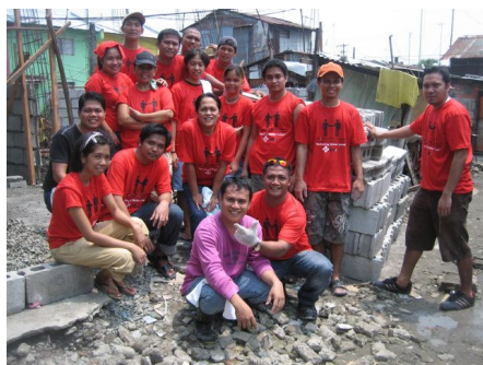
Our Manila Team at work

In the last newsletter you will all have seen the announcement that the Foundation had agreed to support a Squatter Camp redevelopment project in Manila, in partnership with a local Charity Ga-