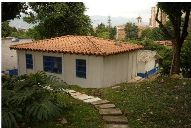
The new vocational training centre

The Vocational Training Centre being constructed at the La Chinca Refuge in Medellin, Colombia is finally taking shape and will see the young women and girls supported by La Chinca using the facility before Christmas.