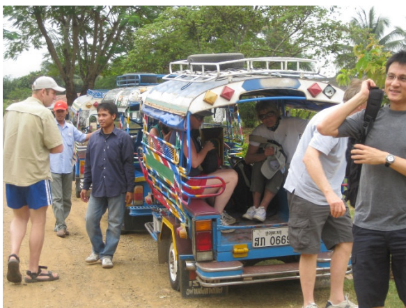
Volunteer team arriving in Tuk Tuks

On the Monday morning we all gathered outside the hotel to begin the first phase of the project – logistics. The transportation consisted of Tuk Tuks and as you would expect it all went well.