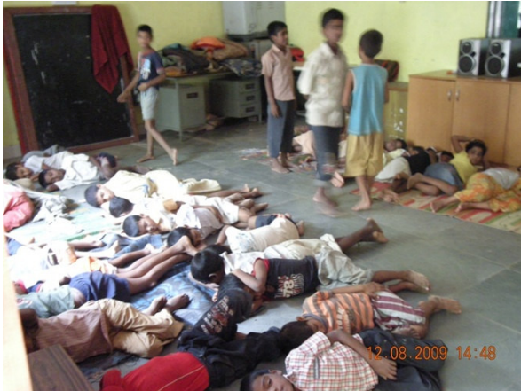
Children at nap time