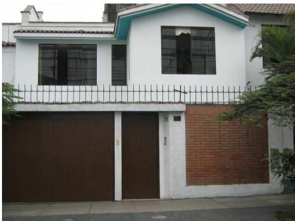
The "New" Aldimi

In our last newsletter we reported that a decision had been made to support the construction of a new Cancer Hospice for the poor in Lima, Peru. This project was to provide housing for 70 to 80 poor people who travel from the country to Lima for cancer treatment at the major cancer hospital in Peru. Unfortunately these people do not have the funds to pay for accommodation so their treatment is compromised.