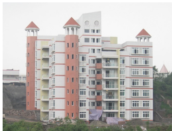
The New Apartment Building

We will share the photos with you when the first children move in so that you can share in the joy the children will have.