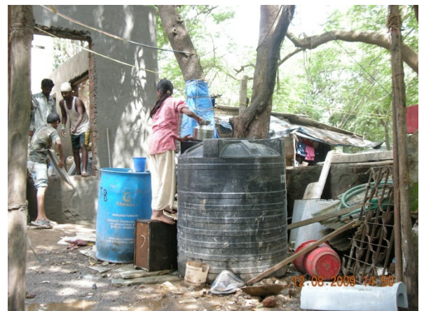
Children drawing water.