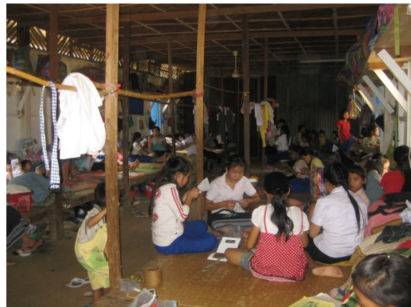
Children playing in the orphanage

algae infested to something that the Romans would be proud of, doors and shutters were back to working order and the painting team were becoming as efficient as any major sub contractor. As the week neared its end the place was beginning to look fresh and modern with new electrical and plumbing services such as kitchen sinks, bi-det's, sweep fans, new switchboard, safety switches even a new water bore.