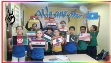
Student talent show from grade 1 to 12