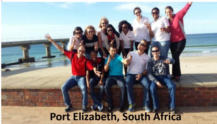
Port Elizabeth, South Africa

To everyone once again thank you. Every cent will be put to a good cause, the photographs below show just some of the fun that teams around the world had.