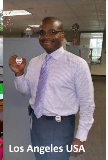
Los Angeles USA