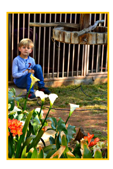
Two of the children helped by the team at Just in Time, Johannesburg, South Africa